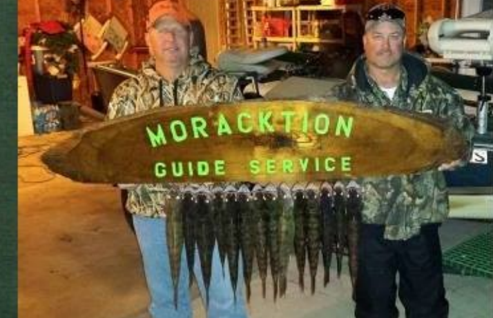
Moracktion Guide Service - Wolf River, Partridge, Poygan, Winneconne Facebook Moraction Guide Service LLC