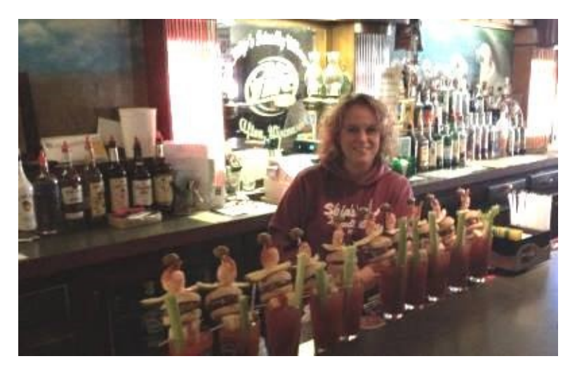
Skip's Friendly Village - Afton, WI Facebook Skip's Friendly Village

Even Keel Marine - Rockford, IL 815-963-1105 www.evenkeelmarine.com