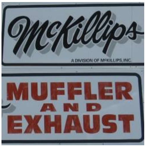
McKilllips Exhaust/Auto Repair - Beloit FB McKillips Exhaust and Auto Repair