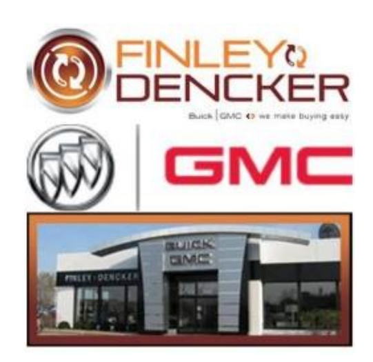
Finley-Dencker Buick GMC - Beloit, WI www.finleydencker.com